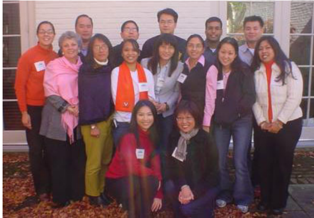
AAPAAN Alumni Council members gather at their most recent meeting in Charlottesville.